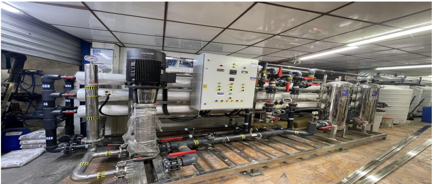
RO System (20) M 3 /hr.