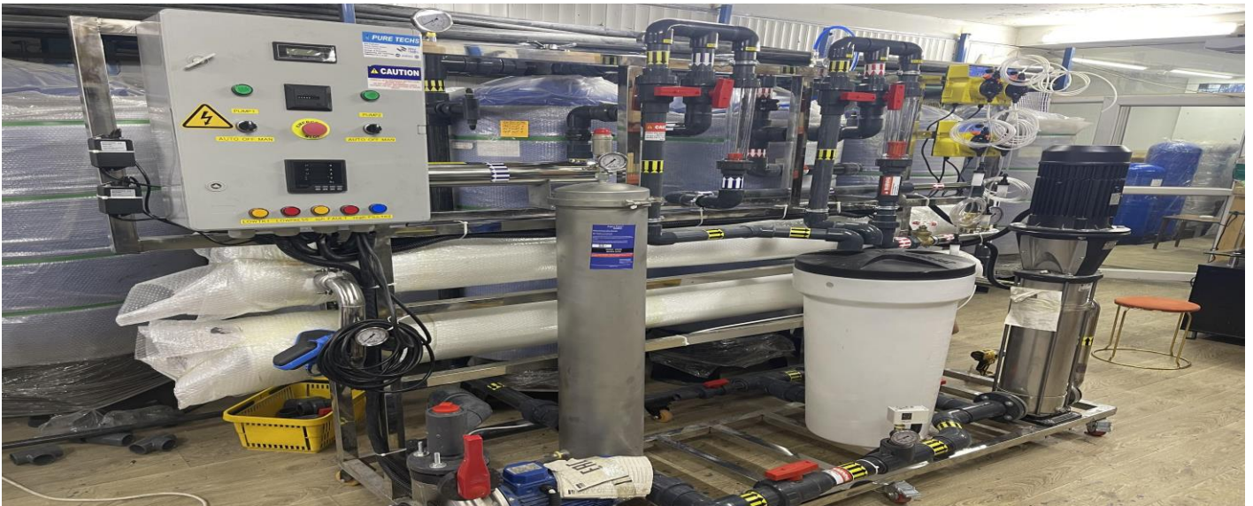
RO System (6) M 3 /hr.