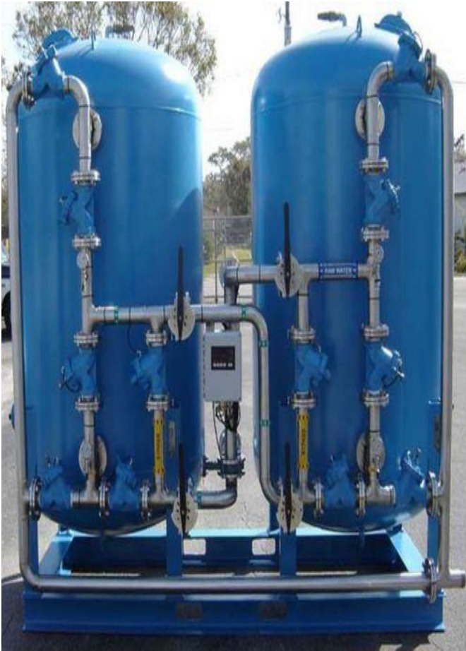
Filtration Capacity (20) M 3 /hr.