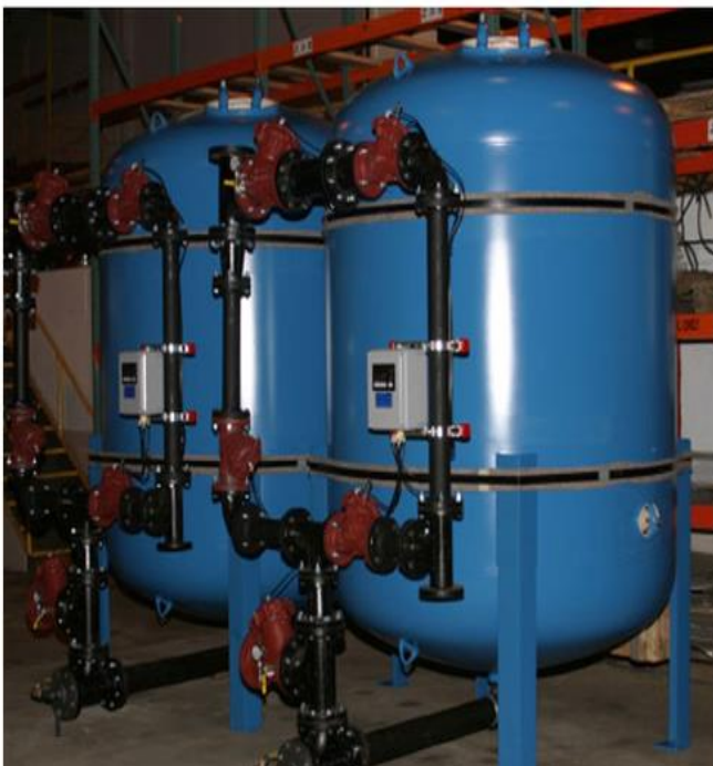
Filtration Capacity (35) M 3 /hr.