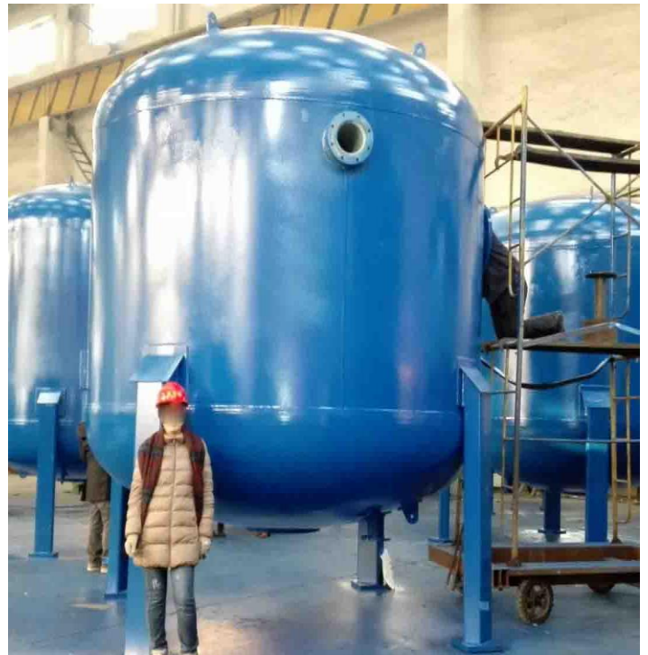
Media Filter Capacity (100) M 3 /hr.