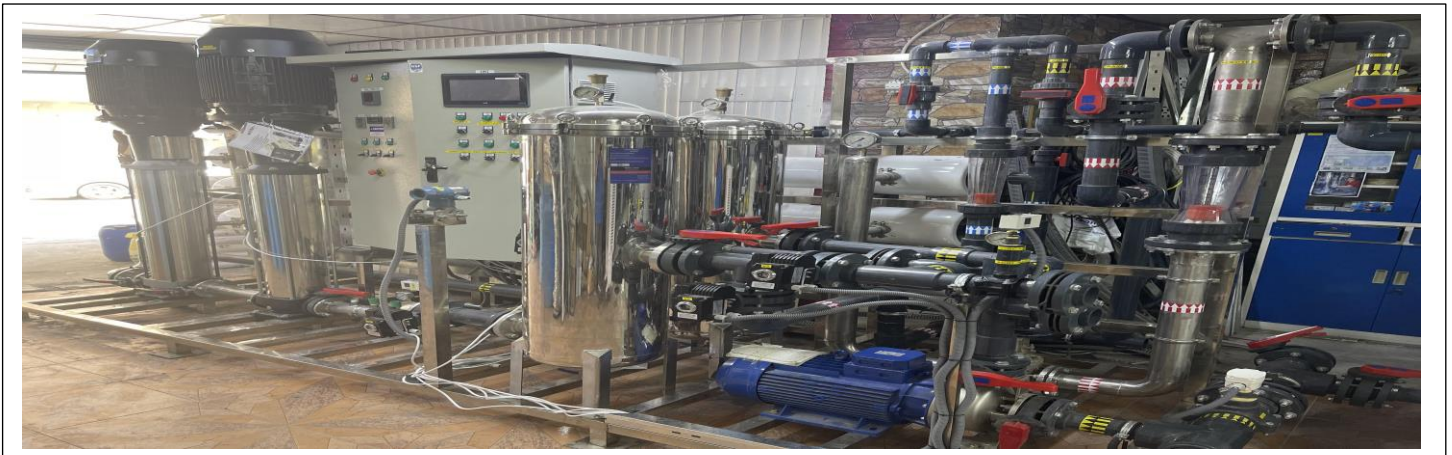
SWRO System (15) M 3 /hr.