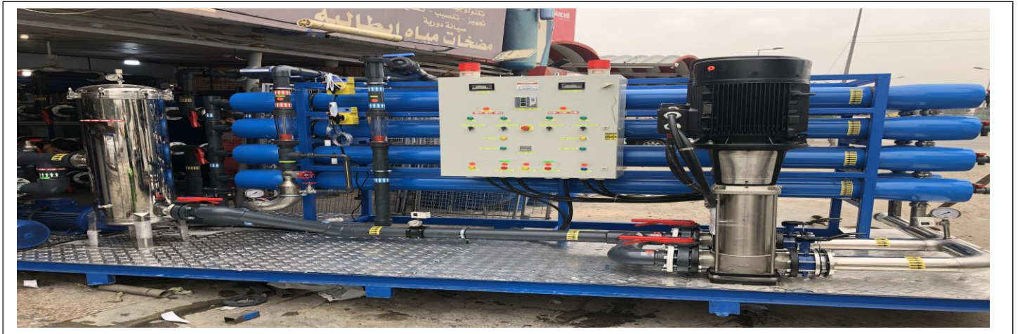
RO System (30) M 3 /hr.