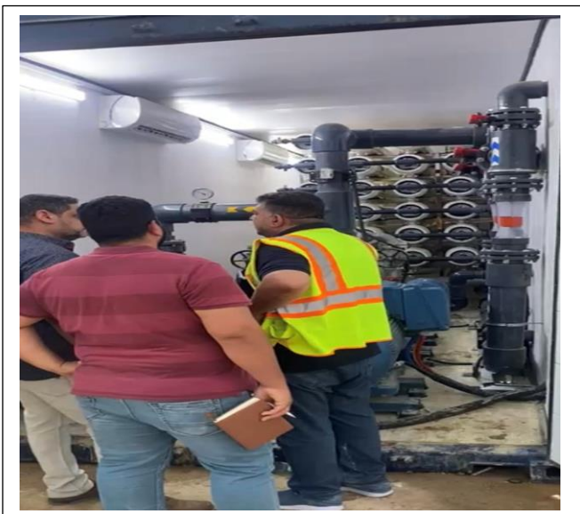
SWRO (100) M 3 /hr.